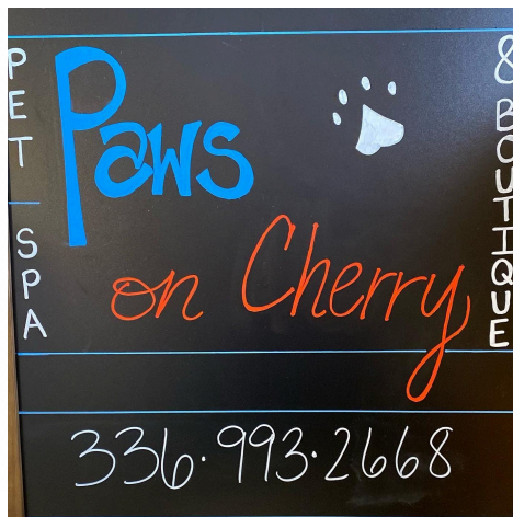
Paws on Cherry