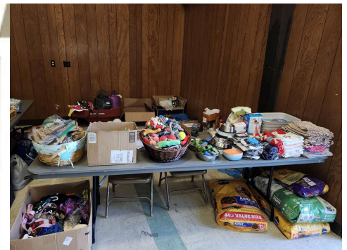
Pet Food Distribution