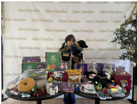
Pet Food Drive